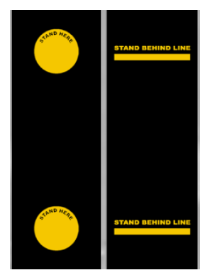
Social Distancing Mat